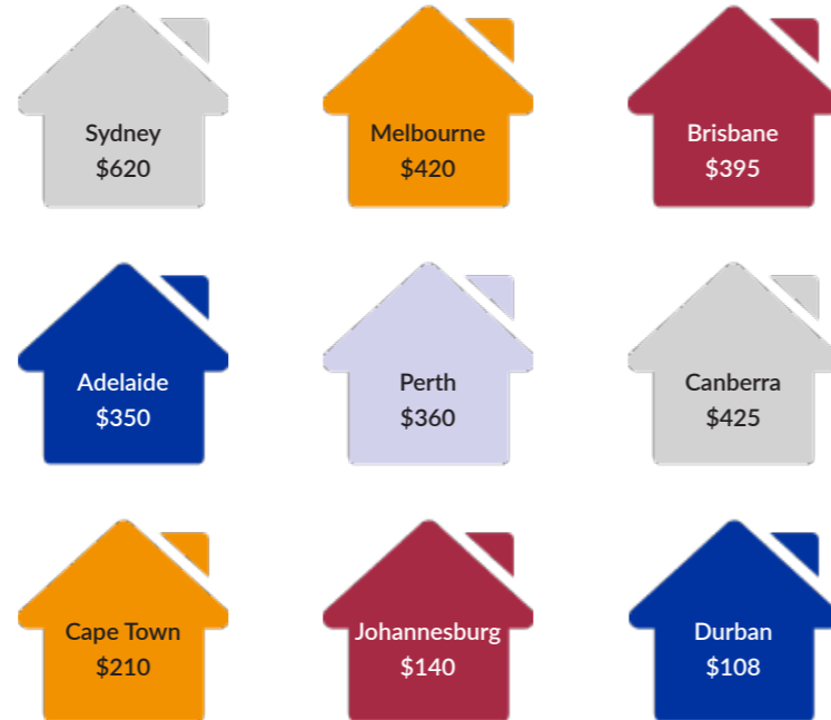
Median weekly rent for a one bedroom apartment (A$)